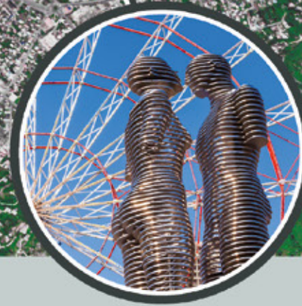
ALI & NINO STATUE